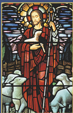
Like a shepherd he feeds his flock

A voice proclaims: "In the wilderness prepare the way of the LORD! Make straight in the wasteland a highway for our God! Every valley shall be lifted up, every mountain and hill made low; The rugged land shall be a plain, the rough country, a broad valley." Isaiah 40:3-4